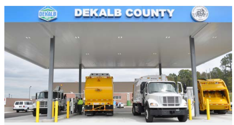
Truck fleet managers should assess various factors to determine the financial viability of converting to or adding compressed natural gas.

<sup>1</sup>VICE 2.0 focuses on CNG because it is the best suited for "yo-yo fleets," or fleets that start and end their day in the same location. Liquefied natural gas (LNG) is considered a better fit for applications that require a more dense concentration of fuel, such as over-the-road trucks or service vehicles that have longer routes.