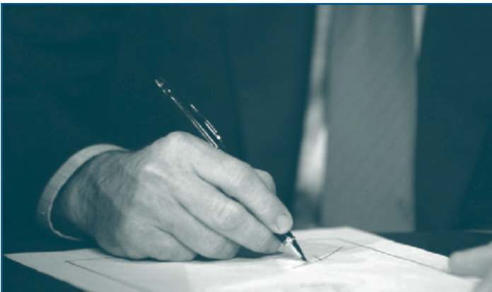
President Bush signed the Energy Policy Act of 2005 into law on August 8.