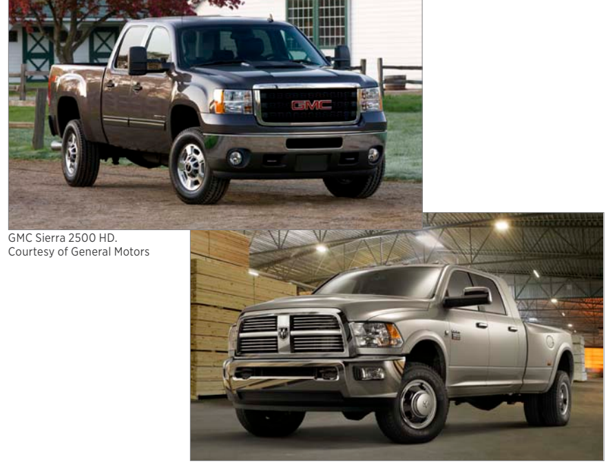
Dodge Ram 3500.

Biodiesel helps lubricate and reduce wear on moving parts. The use of biodiesel blends can reduce tailpipe emissions, such as particulate matter (PM or soot) and hydrocarbons (HC), as compared to diesel. Biodiesel derived from soybeans also reduces overall lifecycle emissions of carbon dioxide by more than half relative to conventional diesel.