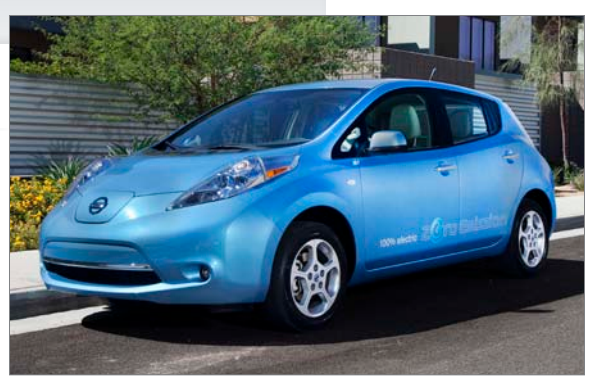
©, 2010 Nissan. Nissan, Nissan model names and the Nissan logo are registered trademarks of Nissan. Courtesy of Brian Konoske