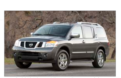
©. 2010 Nissan, Nissan, Nissan model names and the Nissan logo are registered trademarks of Nissan. Courtesy of Guy Spangenberg