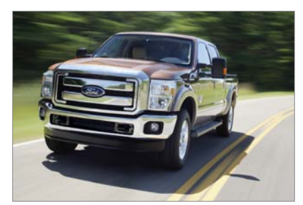
Ford Super Duty F-250.

Several qualified system retrofitters can convert a variety of late-model gasoline vehicles to propane operation. Conversion has little effect on horsepower, torque, towing capacity, or factory warranty. Learn more about conversions on page 7.