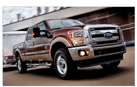
Super Duty F-350.