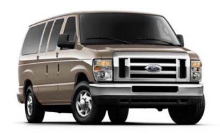
Ford E-350 Van.