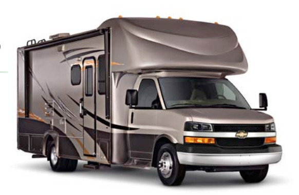
Chevrolet Express Cutaway Van with RV Upfit application.