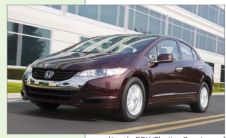
Honda FCX Clarity.