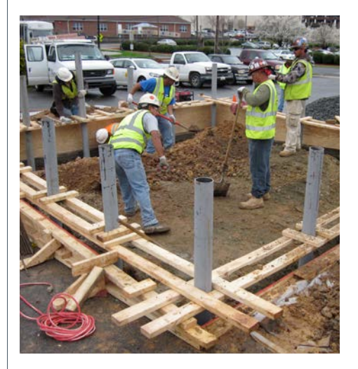
Workers lay the groundwork for a new CNG station in Durham, North Carolina.

"The installation guide has received very positive reviews from stakeholders across the state," Wolfe said. "The North Carolina Department of Public Instruction has even included the publication in a report to the Joint Legislative Energy Policy Commission."