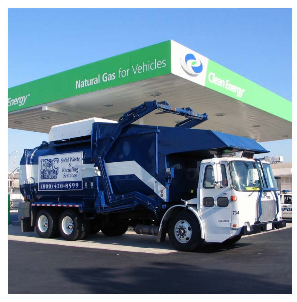
Refuse trucks powered by natural gas are being deployed in increasing numbers by municipalities and refuse operators nationwide.

Clean Cities has had great success working with niche markets. In 1992, the year before the U.S. Department of Energy launched the program, only 2% of transit buses ran on alternative fuels. Since then, the market has skyrocketed—with more than 40% of transit buses using natural gas, biodiesel blends, or hybrid electric technology,