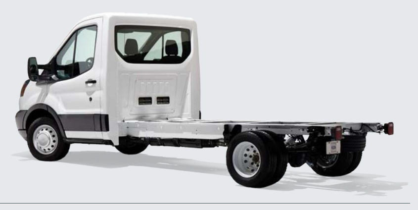
2014 Transit Connect, 2015 Transit Chassis Cab

At a conference in February of this year, NBB launched the final stage of the BQ-9000 program, a retailer