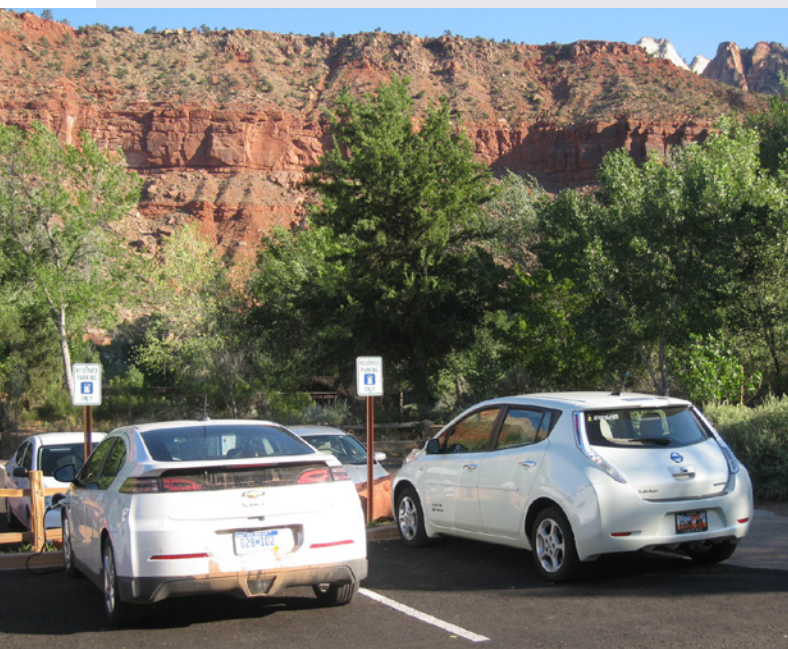
As part of the CCNPI project, the ZNP Group installed seven public and five private charging stations.

After only 12 months, the Zion Group’s PHEVs have already saved more than 500 gallons of petroleum and 5.5 tons of