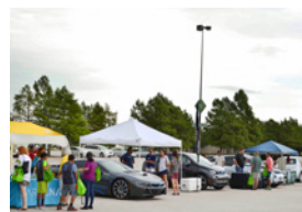
Texas coalition educates event attendees across the state about electric vehicles, p. 16