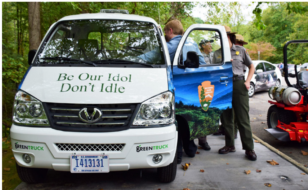
Great Smoky Mountains' "Be Our Idol" campaign encourages drivers to reduce their idling throughout the park.

Five years later, 29 parks together with 19 Clean Cities coalitions have completed more than 30 CCNPI projects. The projects have impacted nearly 70 million visitors and cumulatively reduce about 70,000 gasoline gallon equivalents of petroleum each year. The Initiative also strives to inspire and motivate park visitors to take similar actions when they return home or to their place of business.