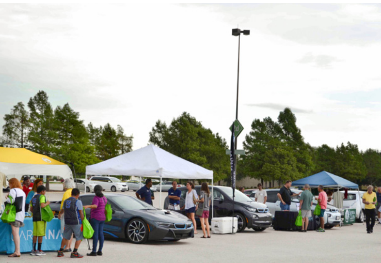
Visitors check out the electric vehicles on display at a National Drive Electric Week event hosted by Dallas-Fort Worth Clean Cities.

The event also featured presentations from the U.S. Department of Energy, ChargePoint, Nissan, and DFWCC.