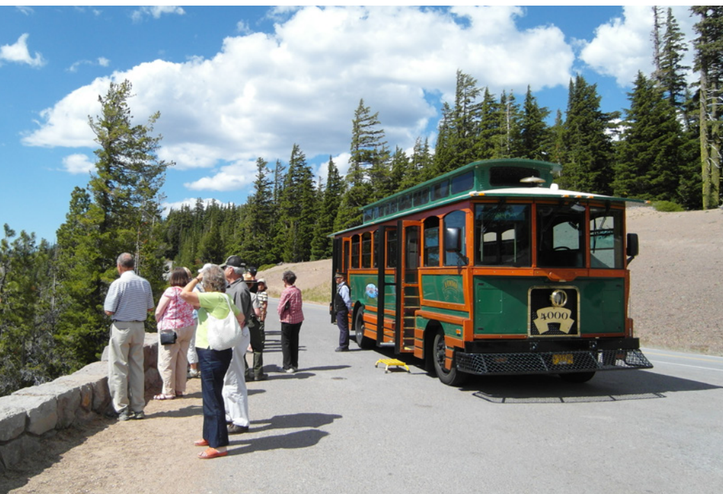
Compressed natural gas-powered trolleys offer visitors a sustainable transportation option when visiting Crater Lake National Park in Oregon.

Today the park runs all fleet vehicles on alternative fuels, and continues to benefit greatly from its partnership with Kentucky Clean Fuels, the local Clean Cities coalition led by longtime Coordinator Melissa Howell. At Crater Lake National Park in Oregon, since 2010 visitors have also gotten around in compressed natural gas trolleys, thanks to a partnership with the local utility and assistance from Rogue Valley Clean Cities, led by Coordinator Mike Quilty.