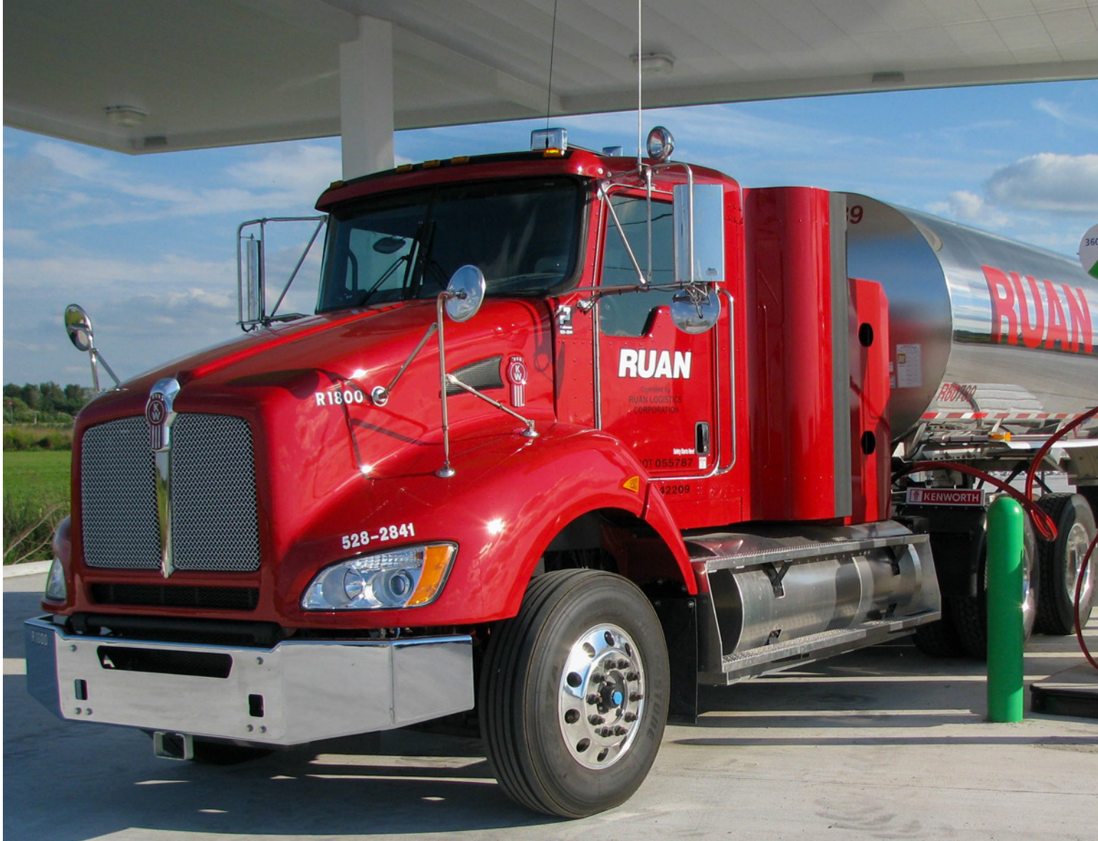
A Ruan milk transport truck fuels up at one of ampCNG's RNG stations. Since 2011, the fleet of CNG trucks has driven 38 million miles.

with Fair Oaks has allowed the venture to become the largest producing digester-to-RNG project in the country. In addition, the fuel production facility at the farm is connected to the Northern Indiana Public Service Company pipeline, so any excess RNG is routed into the pipeline.