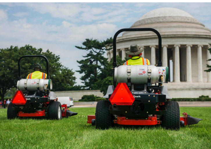
National Mall and Memorial Parks' seven new propane mowers maintain more than 1,000 acres of greenspace around the national monuments.

While the first formal CCNPI projects did not kick off until 2011, Clean Cities and the NPS have been working together since the 1990s. For example, in 1999 Mammoth Cave National Park started using E85, a high-level ethanol blend containing 51%-83% ethanol depending on season and geography.