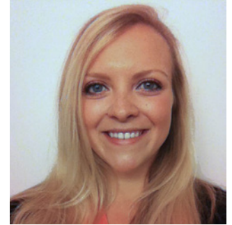
(Left) Sean Reed, Detroit Clean Cities. Photo from Sean Reed; (Right) Heather Croteau, Ann Arbor Clean Cities. Photo from Heather Croteau

The funding enabled the launch of a collaborative effort to introduce alternative fuel vehicles to the park's fleet, while educating staff and visitors about the impact of vehicle fuel use on the climate.