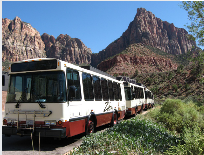
The Zion Canyon Shuttle System also includes propane buses.

GHG emissions. Through their partnership with the Zion Natural History Association, the parks also sell vouchers for the public to use the charging stations.