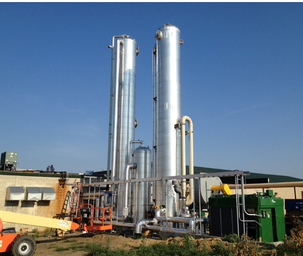
Working with Fair Oaks Farms, ampCNG invested in the largest digester-to-RNG production project in the country. The resulting fuel is used in a fleet of 42 milk transport trucks. Photo from ampCNG, NREL 37377

When ampCNG isn't busy expanding its national network of public natural gas stations, the company is hard at work managing its fleet of long-haul delivery trucks for its subsidiary company, Renewable Dairy Fuels. ampCNG's fleet of milk transport trucks runs on compressed natural gas (CNG) made from cow manure produced at Indiana-based Fair Oaks Farms' dairy operation. In just four years, ampCNG has driven millions of miles on this renewable form of natural gas, or RNG, and has displaced nearly 6 million gallons of petroleum in the process.