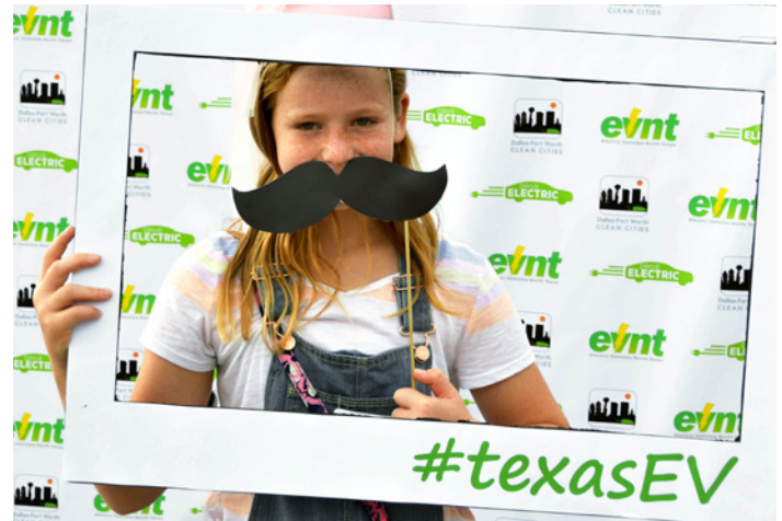
Texas students had fun supporting electric vehicles through a photo booth opportunity offered at a National Drive Electric Week event.

Another outreach opportunity arose when the nationally renowned Perot Museum of Nature and Science in Dallas invited the coalition to participate in the museum’s “discovery days” initiative. Coalition staff members were on hand to answer questions about alternative fuel vehicles while thousands of students checked out the EVs on display.