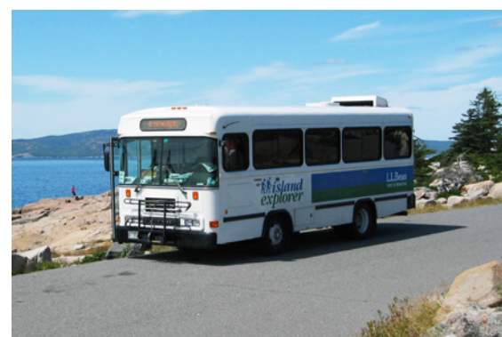
When the system is in operation, Acadia National Park passes support the Island Explorer bus system.