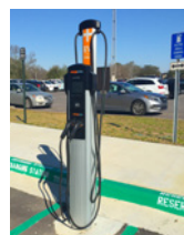
Workplace charging takes off at Louisiana university thanks to coalition's teamwork, p. 17