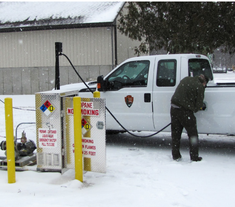
A propane truck gets fueled for use at Sleeping Bear Dunes National Lakeshore.