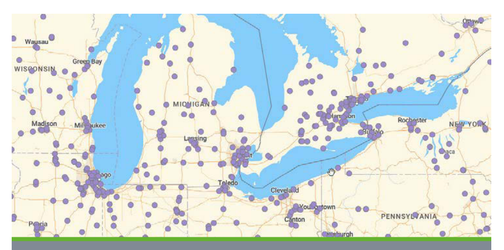
Thousands of fueling stations across the country provide propane. To map propane stations near a specific address or city, use the Alternative Fueling Station Locator (afdc.energy.gov/locator/stations).

Because some training is required, propane may only be dispensed at public stations by a qualified attendant (similar to a full-service gasoline or diesel pump). Likewise, drivers or attendants will need some training to operate private pumps.