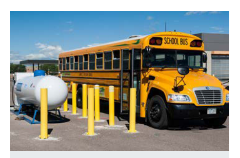
This Colorado school district started with one 1,000-gallon storage tank and later expanded its capacity by adding a second tank.

For current information on retail fuel prices, refer to the Clean Cities Alternative Fuel Price Report (afdc. energy.gov/fuels/prices.html). This report provides regional average retail prices for both public and private stations, so it can potentially serve as a barometer on retail fuel pricing in your area.