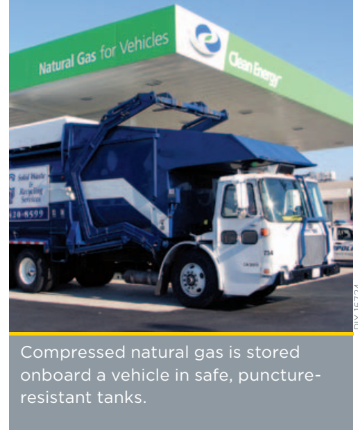
Compressed natural gas is stored onboard a vehicle in safe, puncture-resistant tanks.

the latest new vehicle offerings, also see the AFDC's light-duty and heavy-duty vehicle searches.