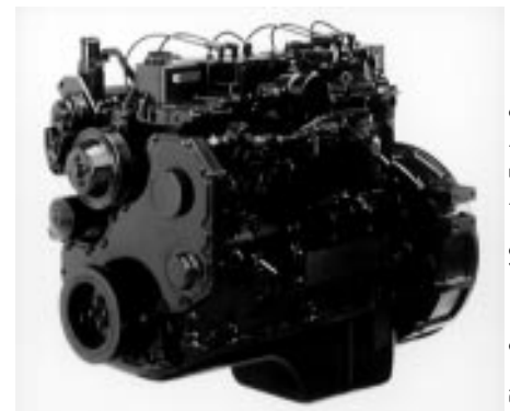
Cummins B5.9G Natural Gas Engine

Photo Courtesy of Cummins Engine Co. / PIX 03841