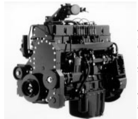
Cummins L10G Natural Gas Engine