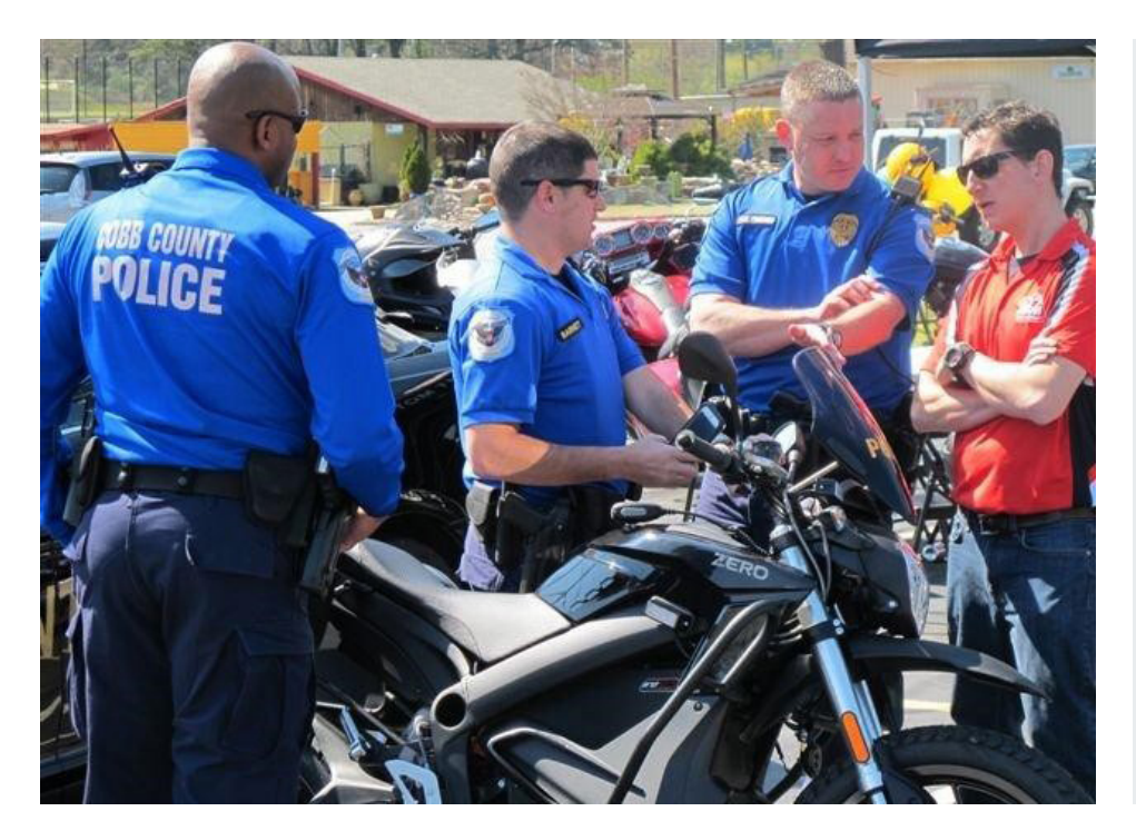
Cobb County police with one of their two Zero all-electric motorcycles.

to alternative fuel goes beyond its fleet; the County's Public Transportation Department demonstrated early success with compressed natural gas (CNG) in the early 2000s with transit buses.