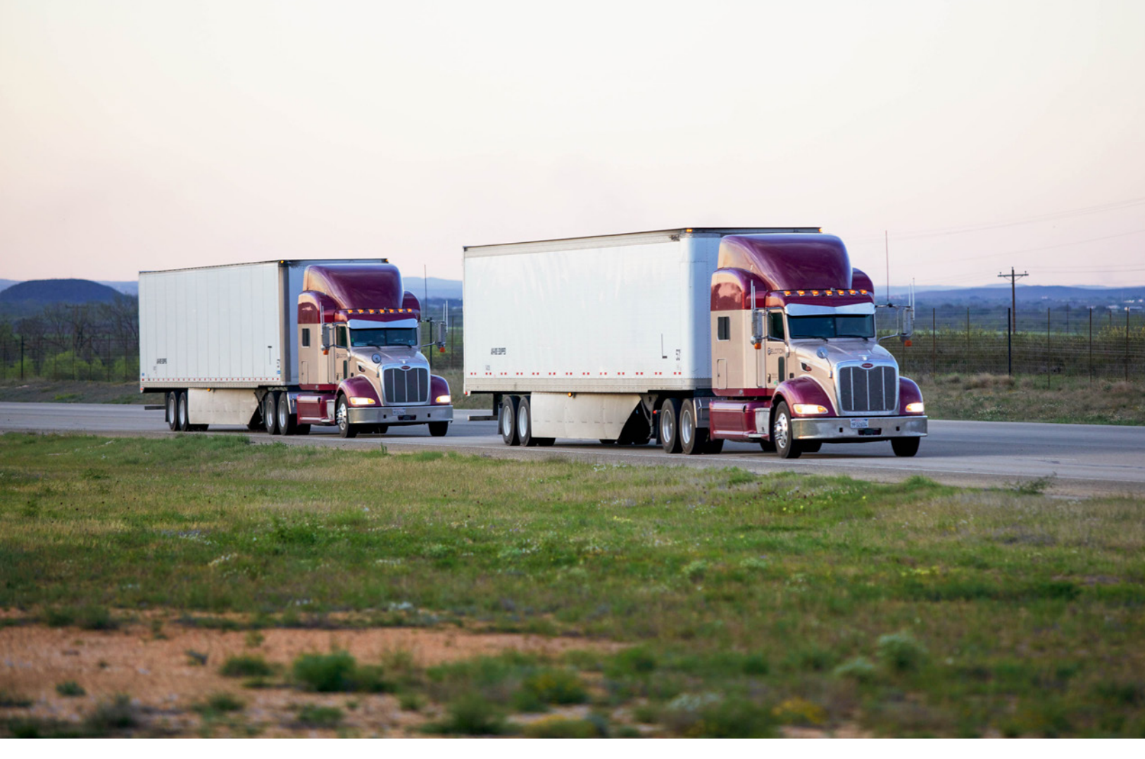
NREL researchers are evaluating truck platooning, a strategy to reduce aerodynamic drag by grouping tractor trailers closely together on the highway.