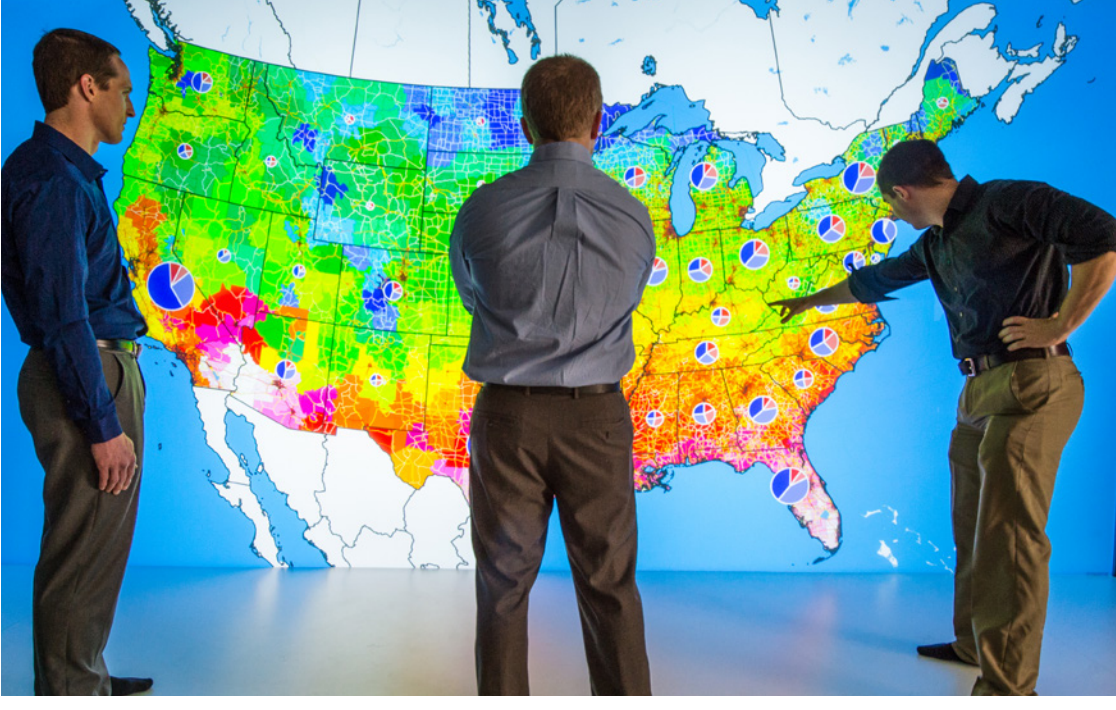
Transportation researchers study a map incorporating roads colored by traffic volume using data from the Federal Highway Administration Highway Performance Monitoring System.

Moving forward, Clean Cities will play a critical role in data measurement and