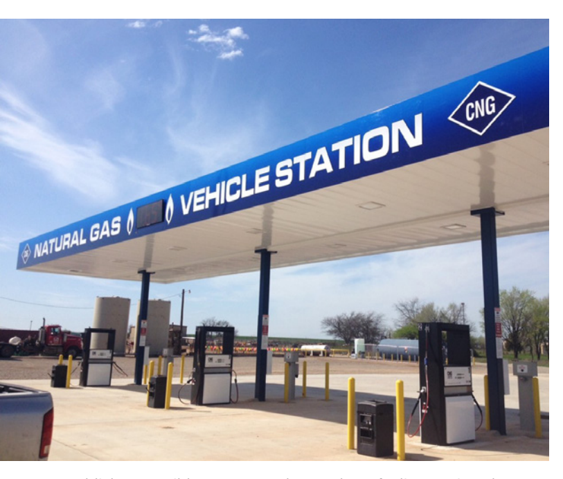
Publicly accessible compressed natural gas fueling station along I-35 in Goldsby, Oklahoma, Photo from Eric Pollard, NREL 39374

"Today, Oklahoma has more public CNG stations than any other state in the country, per capita," Pollard added.