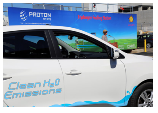
The new hydrogen fueling station in Washington, D.C. Photo from DOE, NREL 40939