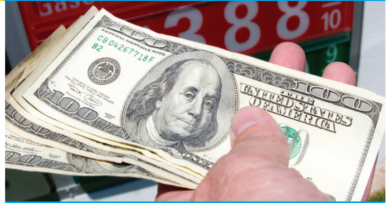
Our gas-saving tips can help you use less fuel and save money.