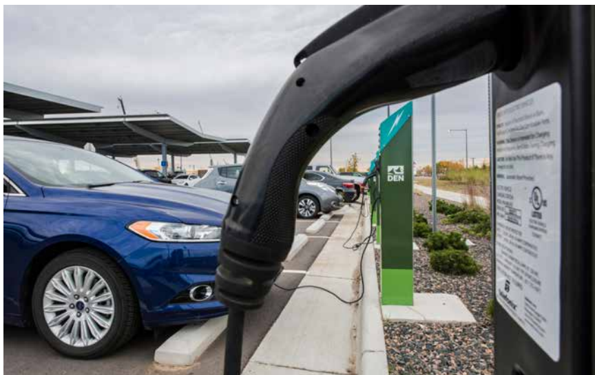
Public charging stations typically include one or more “Level 2” units and may include “DC fast charge” units as well.